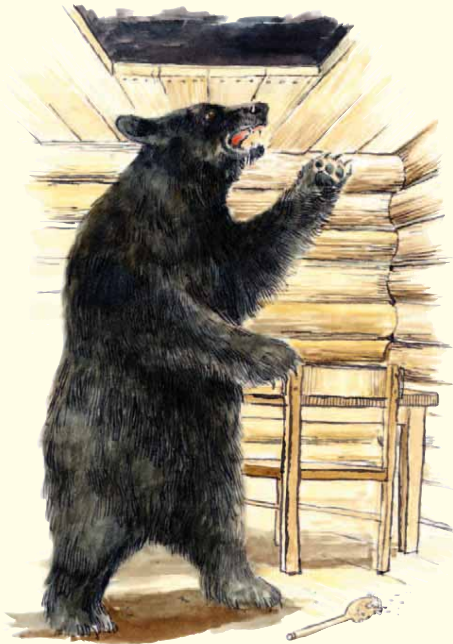
From Lyddie by Katherine Paterson

"Hush," Lyddie commanded. "You'll just make him madder." The cries were swallowed up in anxious gasps of breath. Charles's arms went round the little ones, and Lyddie put a firm grip on her mother's shoulder. It was trembling, so Lyddie relaxed her fingers and began to stroke. "It's all right," she murmured. "He can't reach us."